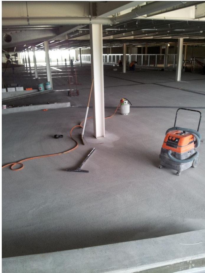
Joints – 171/350R Stripe Coated